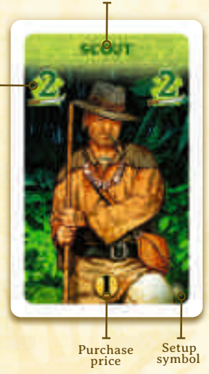
An expedition card

Hiring people and items adds cards to your deck; you may also be able to remove some cards from your deck.