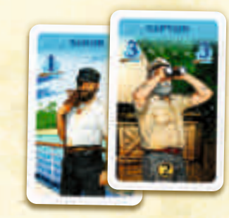
Blue cards give you paddles to move across rivers.