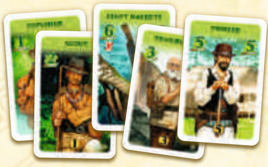
Green cards help you clear a path through the jungle.