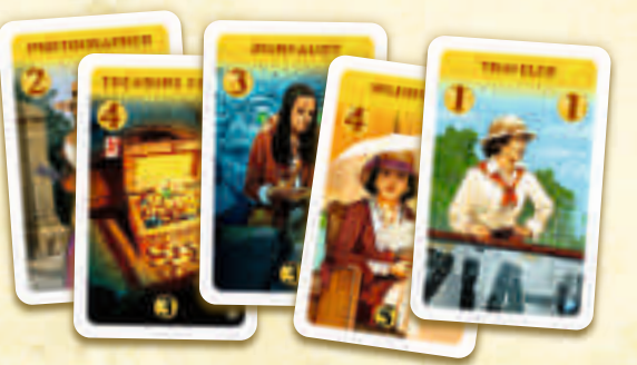
Yellow cards give you coins to travel through villages or hire new team members and items.