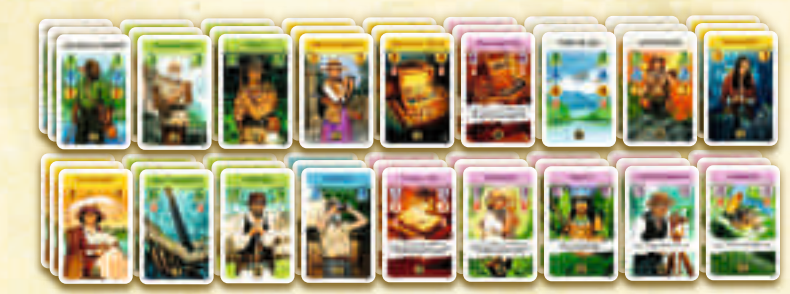
54 marketplace expedition cards (3 each of 18 different card types)

HOW THE GAME WORKS COMPARENT HOW THE GAME WORKS